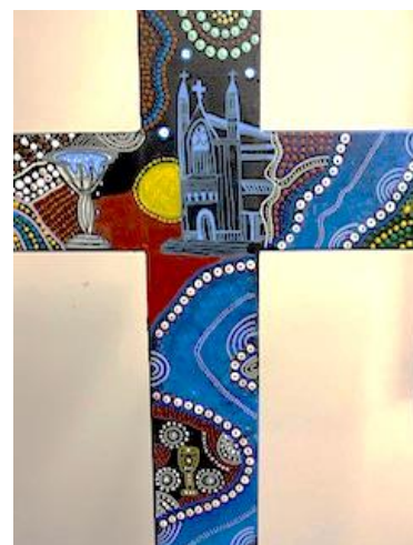
Cross of St Stephens Cathedral

The words of the Aboriginal Our Father are: