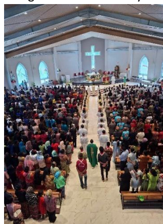
Ossu Parish new Church