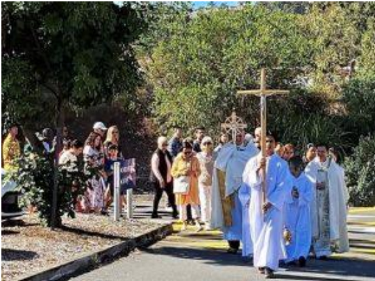
Burleigh Parish Corpus Christi Procession (3 rd Annual) After 10am Mass 2 nd June Mary Mother of Mercy Church - All Welcome