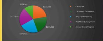
Annual Catholic Campaign 2023

Thank you for supporting the Annual Catholic Campaign last year. Through our combined support, we continue making a positive impact in the lives of those most in need in our community.