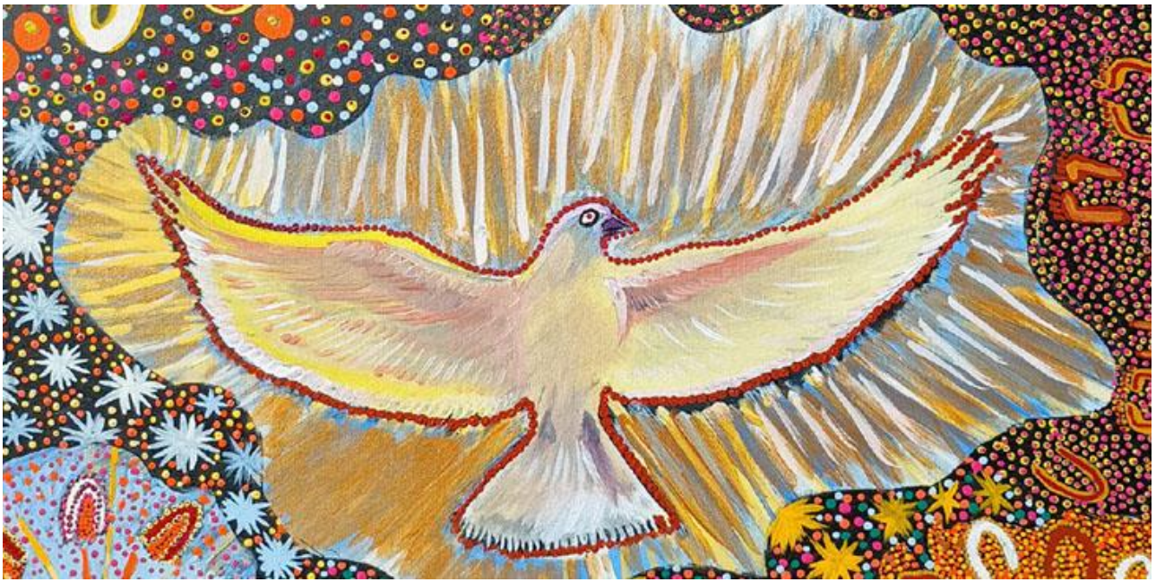
Pentecost painting by Magda Lee, Gracie Mosquito and Imelda Gugamen (Balgo Community)

The four circles in the corners of painting represent the four communities: Wirrimanu, Mulan, Kurrungku and Ringer Soak. The leaders are represented through the horse shoes located around the circle. The different colours represent different people.